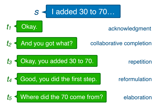
Figure 1: Example student utterance s and possible teacher replies t, illustrating different uptake strategies.

Building on the interlocutor's contribution via, for example, acknowledgment, repetition or elaboration (Figure 1), is known as uptake and is key to a successful conversation. Uptake makes an interlocutor feel heard and fosters a collaborative interaction (Collins, 1982; Clark and Schaefer, 1989),