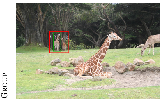
is one of the two in the back? Yes

Figure 1: A vast amount of questions asked by humans in the GuessWhat?! game (de Vries et al., 2017) are spatial. We classify them as absolute , relational , and group based on how they many objects are involved and how they are related. The red box marks the object(s) involved in the question, while the green box marks the target of the game. Relational and group questions need more than one object, whereas absolute do not.