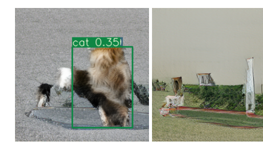
Figure 1: Sample generated images for The cat ran away from the dog (left) and The house ran away from the dog (right). In the left image, both a dog and a cat were identified by the object detector. The SOA-C scores for the two sentences were 1/3 and 0, respectively (N=3, C=1 (dog)).