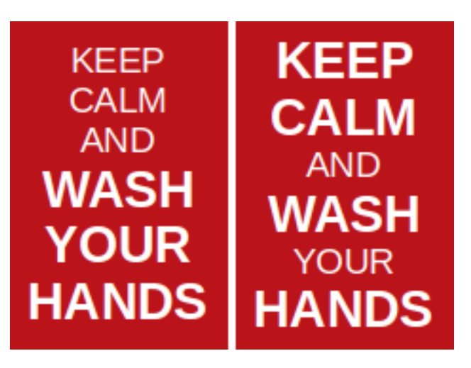
Figure 1: Two examples with different emphasis

The data was labeled by 9 annotators, for further details please refer to the task paper (Shirani et al., 2020).