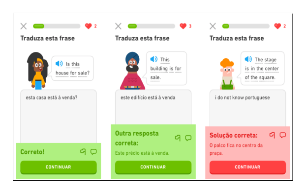
Figure 1: Translations proposed by English language learners at various levels of fluency, from diverse backgrounds. Our multi-checkpoint ensemble models mimic learner fluency.<sup>4</sup>

The main set up of the 2020 Duolingo Shared Task on Simultaneous Translation And Paraphrase for Language Education (STAPLE 2020) (Mayhew et al., 2020) is such that one starts with a set of English sentences (prompts) and then generates highcoverage sets of plausible translations in the five