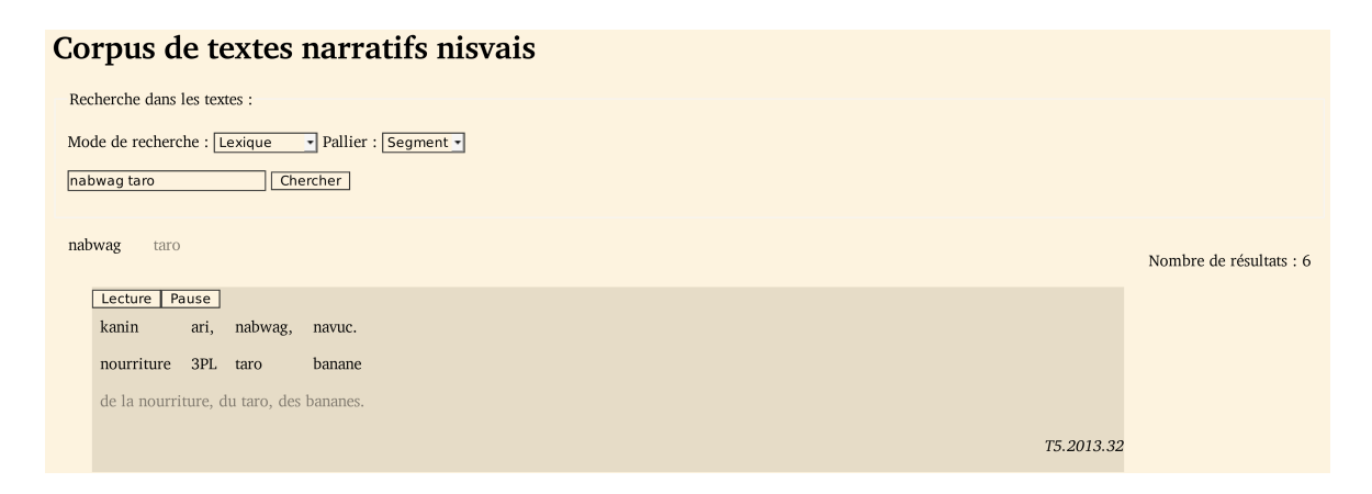
Figure 3: Interface for seeing and listening to the interlinear annotations.