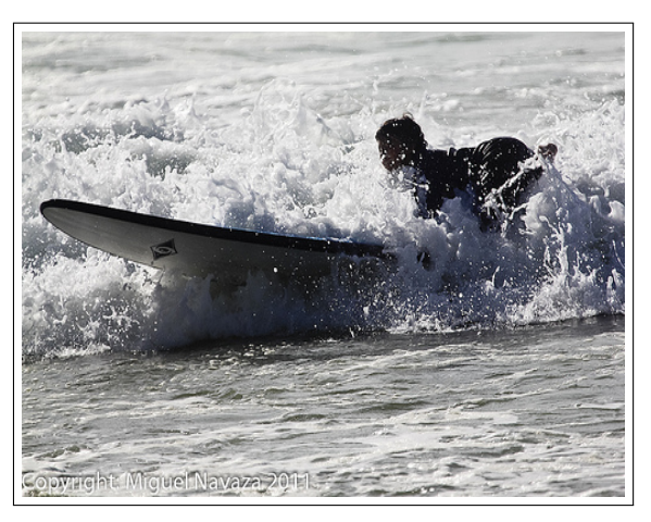
(b) HUMAN: A large splash is in front of a wave in the water. There is a large white and black surf board in the water. There is a black dog that is riding on top of the surf board. IMG+MAX : A man is riding a wave. He is holding a surfboard. The man is wearing a black wet suit. LNG+MAX : A person is surfing in the water. The surfboard is black and white. The surfboard is black and white. IMG+LNG+MAX : A man is standing on a surfboard. The surfboard is black. The man is wearing black shorts. IMG+ATT : A man is standing on a surfboard. The surfboard is black and white. The man has black hair. LNG+ATT : A person is standing in the water. The person is

IMG+LNG+ATT : There is a parking meter on a sidewalk. There are cars next to the street. There is a parking lot next to the street.