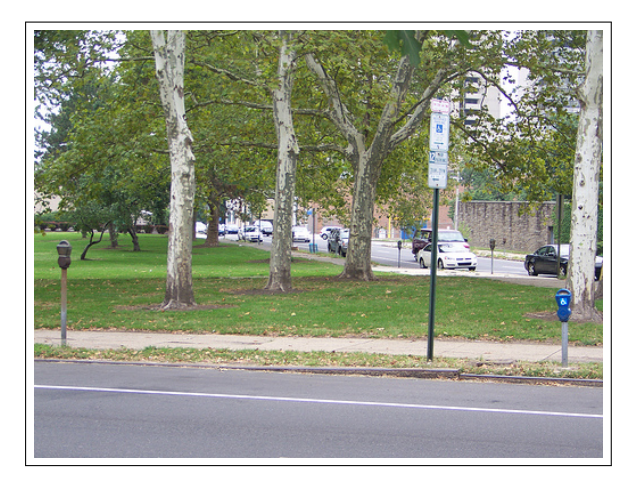
(a) HUMAN : There are several cars parked along a street. There are many trees in a field in front of the street. There are small blue parking meters on the sidewalk next to the street.

IMG+MAX : There are several cars parked on the road. There are cars parked on the street. There are trees behind the street.