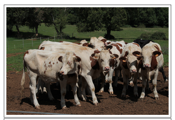
DESCRIPTION: there are two cows standing in the field. there are trees behind them.

You can enter any feedback you have for us, for example if some questions were not easy to answer, in the corresponding feedback field (right after the survey).