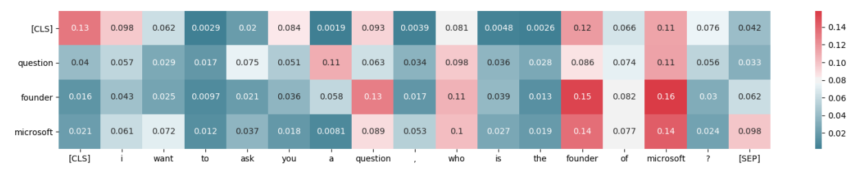
Figure 3: Attention Visualization of Core Words in Question

Our encoder Transformer has 24 layers, and each layer has 16 attention heads. In the process of multi-layer coding, some studies believe that the lower layers may have more syntactic and grammatical features. In contrast, the upper layers may have more overall abstract semantic features(Peters et al., 2018). Therefore, we choose the attention value of the last layer for visual analysis. For the convenience of visualization, we average the attention weights of the 16 attention heads to represent the final attention distribution, as shown in Fig.3.