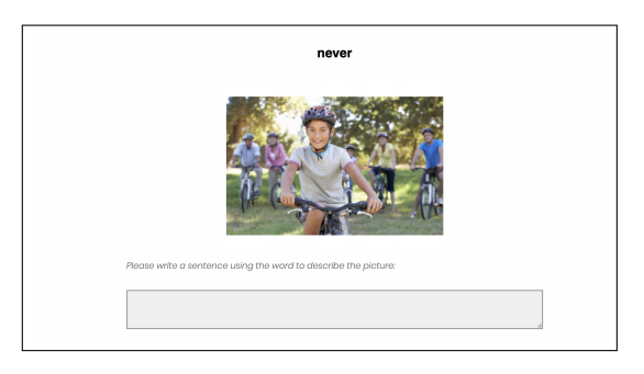
Figure 1: Example of the formulated sentence task (stimulus 3 of Task 1). For Task 2, only the target word "never" is displayed, and for Task 3 only the image is displayed.

Integrating a target word into an image description requires more complicated linguistic competence than using the target word to make a sentence or having a free choice of vocabulary in describing an image. Therefore, Task 1 is considered to be more challenging than Task 2 or 3. As shown in Table 1 and Figure 2, there are significantly more sentences in Task 1 that are scored 0 or 1 than in