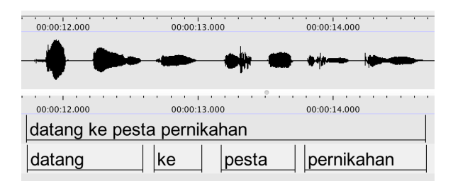
Figure 3: Treatment of pauses in teacher speech

rization of teacher's speech. The aforementioned methodological difficulties of teasing apart speech data and the questionable validity of delimiting languages raised by the translanguaging framework were central to our transcription guidelines. We also note that pauses in the teacher's language and other easily overlooked phenomena might skew the time counted towards a given language (Figure 3). We assessed that L2 was vulnerable to this skewing as the teacher extended pauses between words unfamiliar to the students, thus expanding the time counted as L2 speech. Conversely, cutting the L2 use apart when a teacher paused removed between-word-time from a cumulative L2 count and artificially shortened the time spent in the language.