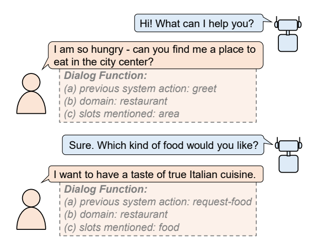
Figure 1: Illustration of the dialog function of each turn's user utterance.

in the dialog. Therefore through delexicalization, the language variations brought by numerous slot values can be reduced, thus it is easier to find paraphrases.