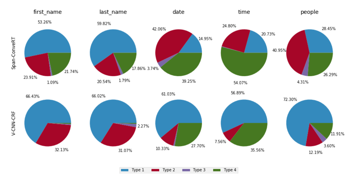
Figure 4: Breakdown of errors made on the test set of RESTAURANTS-8K after training on a 16th of the train set.