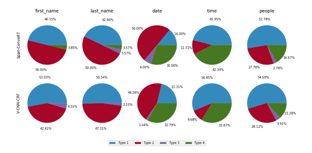
Figure 3: Breakdown of errors made on the test set of RESTAURANTS-8K after training on the entire train set.