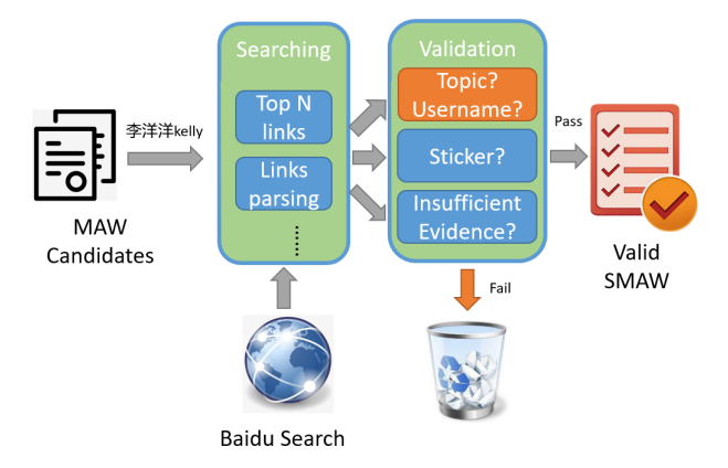
Figure 2: Flowchart of Search Engine Validation

Let us examine a user name as an example. "李 洋洋kelly", "Yangyang Li, Kelly" is a username combined with a Chinese name and an English nickname). The top N links are first collected as external evidence. The linked text is then cleaned and parsed to check whether this MAW candidate is meaningful. In the case of "李洋洋kelly" occurs only as "@李洋洋kelly". Thus, it is validated as a username, not a real MAW. In addition to username checking, stickers and in sufficient occurrences are also used as indication of invalid MAWs.