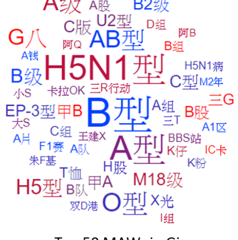
Top 50 MAWs in Giga