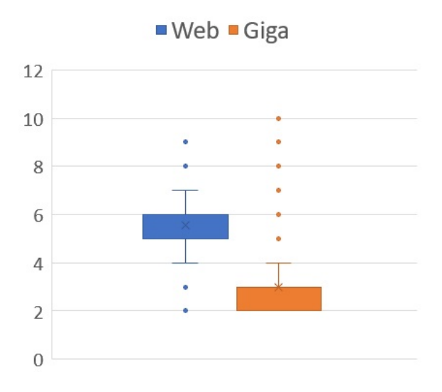
Figure 4: Length distribution of MAWs in Giga and Web

mean length in SNAW is around 5. Overall, the MAWs in Web are distributed across a wider span. This may imply a tendency of code-mixing words being longer and richer in Modern Chinese.