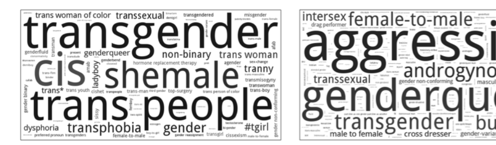
Figure 3: Word clouds representing the relative frequency of trans words used by self-identifying trans people on Twitter in the U.S.A. (left) and self-identifying trans people in questions three and four of the NTDS (right)