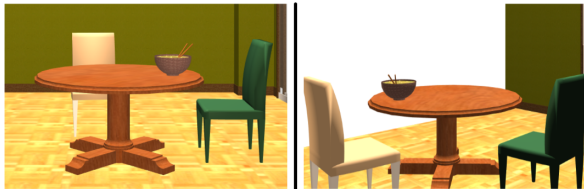
Figure 4: Left: chair is selected by “chair to the right of the table” or “object to the right of the table”, but not selected by “cup to the right of the table”. Right: Different view results in a different chair selection for “chair to the right of the table”.