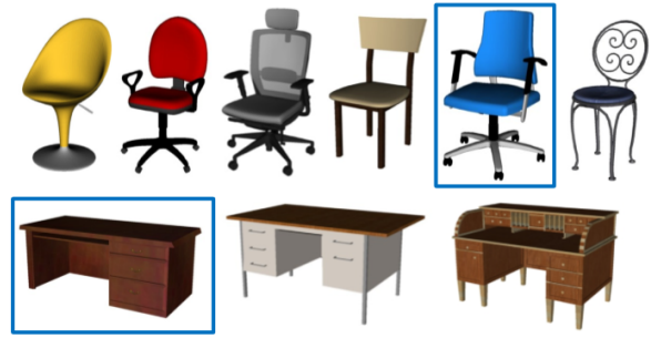
Figure 3: Select “a blue office chair” and “a wooden desk” from the models database

Object Selection Once we have the scene template, we use the keywords associated with each object to query the model database. We select randomly from the top 10 results for variety and to allow the user to regenerate the scene with different models. This step can be enhanced to take into account correlations between objects (e.g., a lamp on a table should not be a floor lamp model). See Figure 3 for an example of object selection.