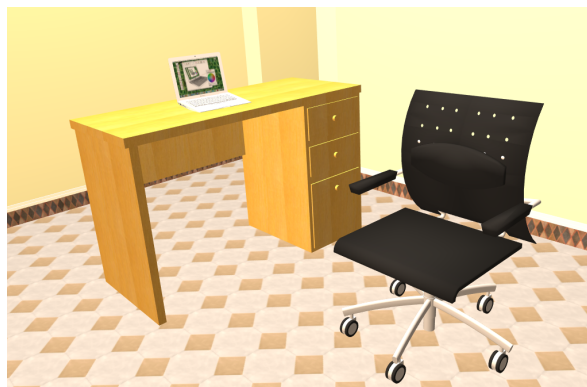
Figure 1: Generated scene for “There is a room with a chair and a computer.” Note that the system infers the presence of a desk and that the computer should be supported by the desk.