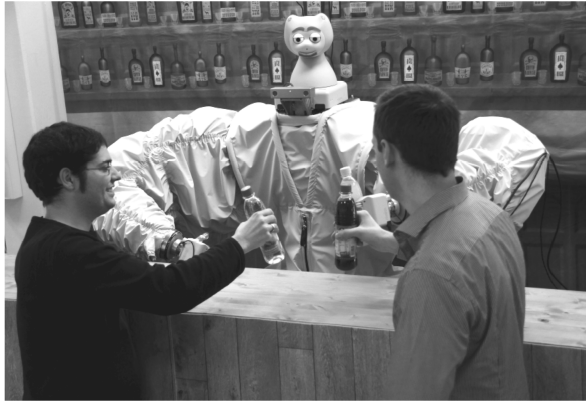
Figure 1: The robot bartender with two customers

put. The SSE is modelled as a hierarchy of two connected Markov Decision Processes (MDPs) with action selection policies that are jointly optimised in interaction with a Multi-User Simulation Environment (MUSE).