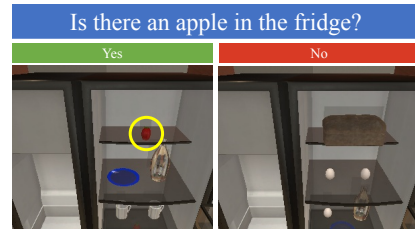
Figure 3: IQA data construction attempts to make both the question and image necessary for QA.