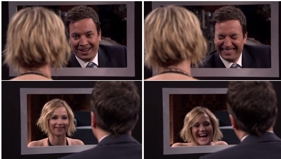
Figure 1: Sample screenshots of truthful and deceptive behavior from the original video clips; left-top (truthful) : Eyebrows-raising, Eyes-open; left-bottom (truthful): Eyebrows-neutral, Eyes-open; right-top (deceptive): Eyebrows-frowning, Eyes-closing (both); right-bottom (deceptive): Eyebrows-raising, Eyes-closing (both).

ster on a plate. The description contains truthful and deceptive aspects, but it is considered to be a deceptive round since the main purpose of the statement is to deceive. This fine-grained distinction is captured during the annotation of behaviors, described below, which allows us to obtain more precise veracity labels of the behavior. In our example, the behavior associated with the description "green" is labeled as deceptive, whereas all the other behaviors are labeled as being truthful.