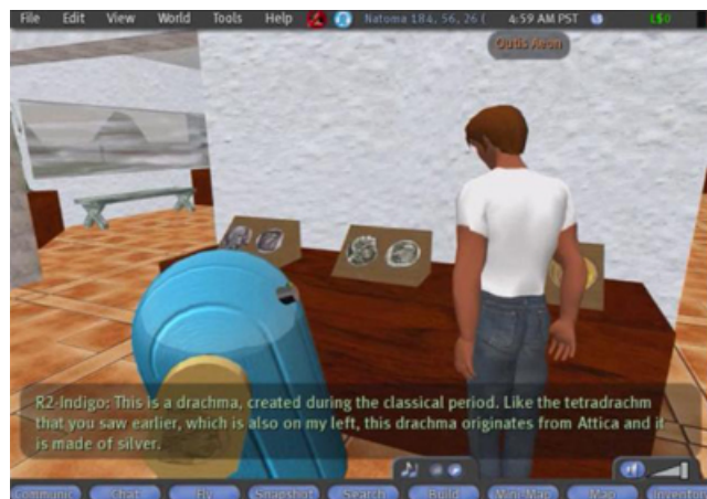
Figure 1: Generating texts in Second Life.

templates instead of systemic grammars, it is publicly available as open-source software, it is written entirely in Java, and it provides native support for OWL ontologies, making it particularly useful for Semantic Web applications (Antoniou and van Harmelen, 2004). 3 Well known advantages of natural language generation (Reiter and Dale, 2000) include the ability to generate texts in multiple languages from the same ontology; and the ability to tailor the semantic content and language expressions of the texts to the user type (e.g., child vs. adult) and the interaction history (e.g., by avoiding repetitions, or by comparing to previous objects).