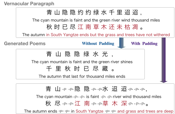
Figure 2: A real example to show the effectiveness of our phrase-segmentation-based padding. Without padding, the vernacular paragraph could not be aligned well with the poem. Therefore, the text in South Yangtze ends but the grass and trees have not withered in red is not covered in the poem. By contrast, they are covered well after using our padding method.

According to Ye (1984), to present a stronger sense of rhythm, each type of poem has its unique phrase segmentation schema, for example, most seven-character quatrain poems adopt the 2-2-3 schema, i.e. each quatrain line contains 3 phrases, the first, second and third phrase contains 2, 2, 3 characters respectively. Inspired by this law, we segment lines in a poem according to the corresponding phrase segmentation schema. In this way, we could avoid characters within the scope of a phrase to be cut apart, thus best preserve the semantic of each phrase.(Chang et al., 2008)