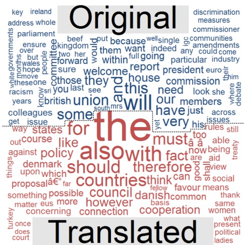
Figure 1: EuroParl Word Cloud Data Visualization (Translated vs Original) 1

sky et al., 2012a; Lembersky et al., 2013; Lembersky et al., 2012b). Few parallel corpora including a customized version of EuroParl (Islam and Mehler, 2012) and a processed version of Hansard (Kurokawa et al., 2009) are labeled for translated versus original text. Using these limited resources, it has been shown that taking the translation direction into account when training a statistical machine translation system can improve translation quality (Lembersky et al., 2013). However, improving statistical machine translation using translation direction information has been limited by several factors.