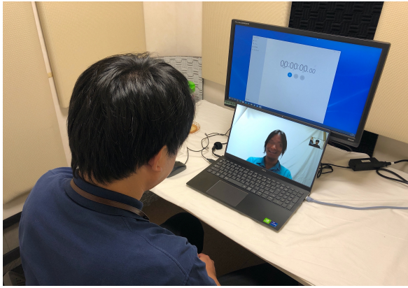
Figure 2: The photograph of two-party remote dialogue.

the ICC for each combination of three to five annotators, and calculated the weighted average by considering the number of samples. The results were ICC(2, k) = 0.571 . This result suggests that praising scores are reliable data with a medium level of concordance among annotators. In our previous study (Onishi et al., 2020), an annotator judged whether utterances were praising, and participants who were the receiver in each dialogue rated the praising skills of the partner. However, we were concerned that the judgments and evaluations would be subjective, so the judgments and evaluations were performed by five annotators.