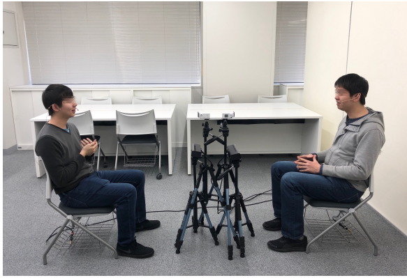
Figure 1: The photograph of two-party face-to-face dialogue.

two-party dialogues were 34 university students in their twenties (28 males and six females) who were divided into 17 pairs. Among the 17 pairs, 14 pairs included participants meeting for the first time, two pairs included acquaintances, and one pair included friends. To begin recording dialogues, we requested participants to prepare two or more episodes about what they had been working hard to prepare materials for the dialogue. The participants were seated facing each other and separated by 180 cm apart, as shown in Figure 1. The dialogues were recorded using a video camera to record each participant’s head and face behaviors and a microphone to record each participant’s voice. Each pair of participants (participants A and B) performed dialogues (1) to (3) in accordance with the experimenter’s instructions.