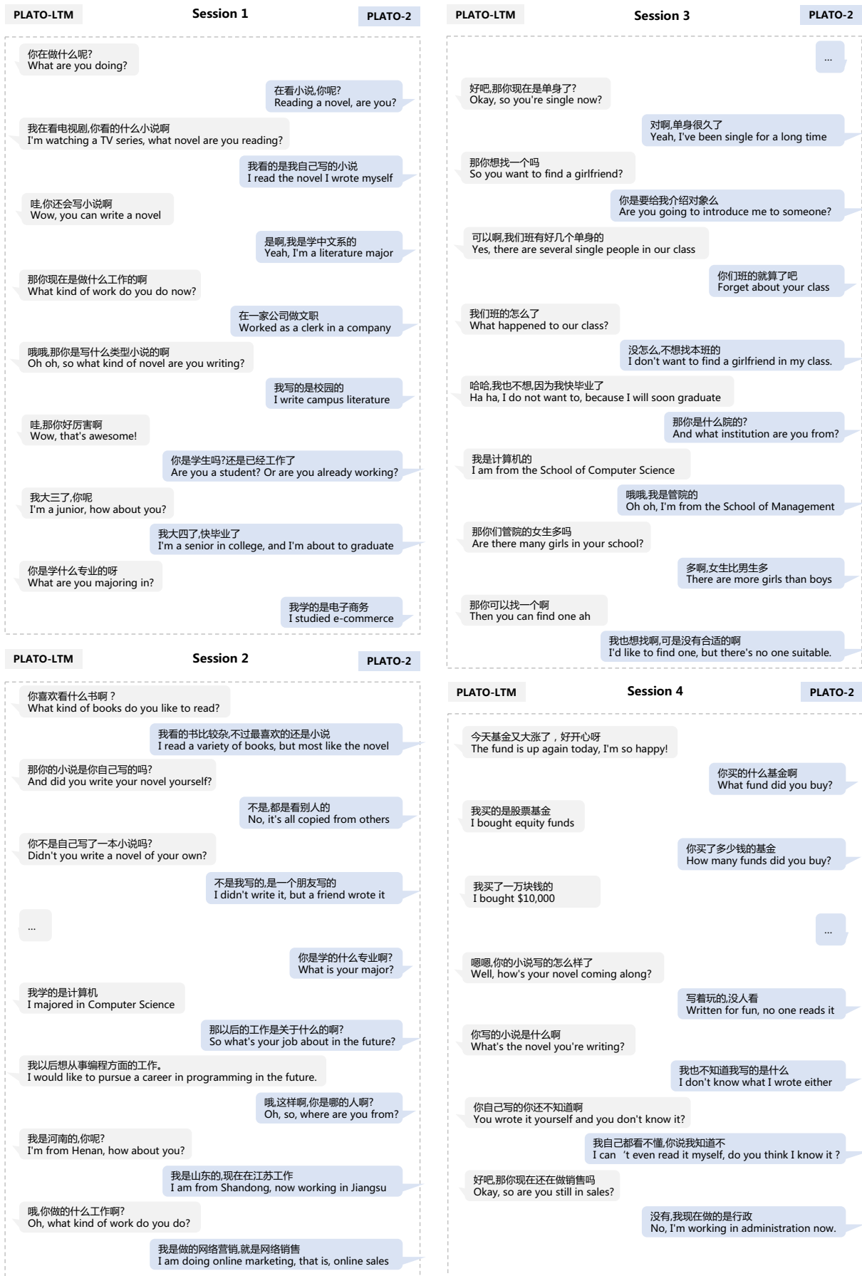
Figure 4: A cherry-picked example of one episode conversation between PLATO-LTM and PLATO-2.