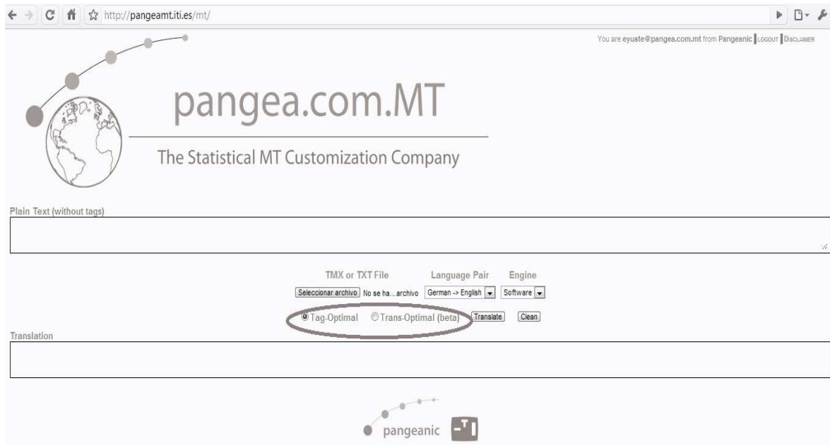
Figure 2. Tag-Optimal and Trans-Optimal selection feature

PangeaMT solutions delivered in a web interface have an interesting interactive feature in this respect. In such interface, before uploading the file to translate in a TXT, TMX or XLIFF format, the user can select the language pair and domain of