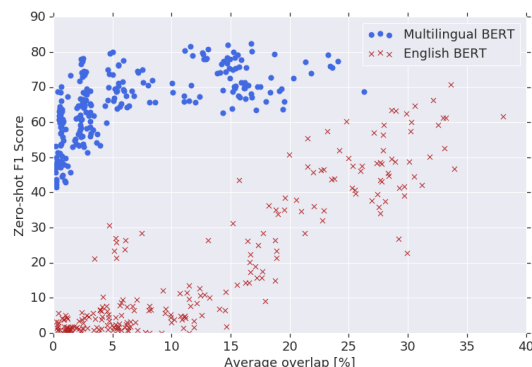
Figure 1: Zero-shot NER F1 score versus entity word piece overlap among 16 languages. While performance using EN-BERT depends directly on word piece overlap, M-BERT’s performance is largely independent of overlap, indicating that it learns multilingual representations deeper than simple vocabulary memorization.