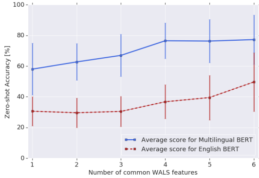
Figure 2: Zero-shot POS accuracy versus number of common WALS features. Due to their scarcity, we exclude pairs with no common features.