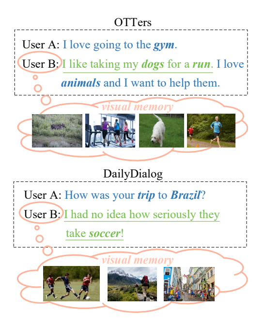
Figure 1: Examples from two pure language dialogue datasets, where the underlined green part is the output that needs to be generated<sup>1</sup>. The hidden visual memory, which contains associative commonsense and needs to be explored, can be essential for humans to make proper responses during the conversation.

Another series of solutions augment the training corpus with extra information like emotions or per-