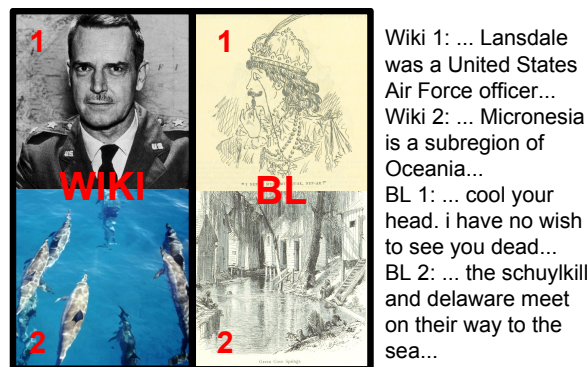
Figure 3: Images in this figure are reproduced in accordance with the following licensing information. The original authors of the images do not necessarily endorse this work or the opinions expressed in it. Wiki – US Air Force (public domain); Fairings (public domain). The BL images are also public domain, and were originally released by the british library.