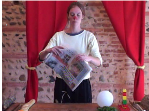
Figure 2: Action movie

more details on the experiment. As reported in details in (Desalle et al. , 2010), the results confirm that 2-4 years old children produce more approximations than adults. According to the hypothesis, these differences between young children and adults should be retrieved by the study of the lexical organization of verbs.