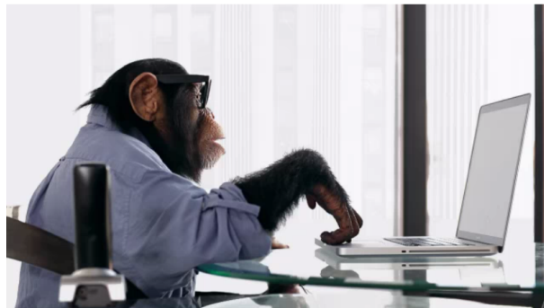
Figure 1: Taidhgín : the prototype dialogue partner.