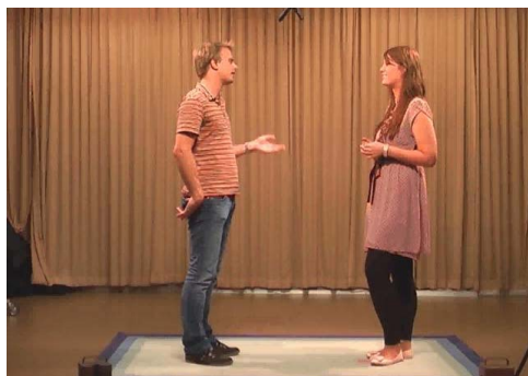
Figure 2: Snapshot from the corpus: side camera view