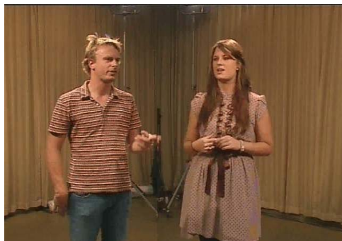
Figure 1: Snapshot from the corpus: frontal camera views

female and one with a male. The two conversations were recorded on two different days (Paggio and Navarretta, 2011). In Figure 1 and 2 snapshots from one of the recordings are given.