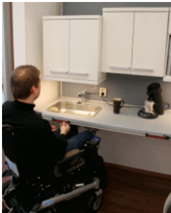
Figure 1. Kitchen cabinets moving down

Figure 1 shows a smart appliance, i.e. the kitchen cabinet, which is moving down, so that it can be reachable for the wheelchair user.