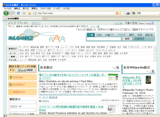
Figure 1: Screenshot of “Minna no Hon’yaku” site ( http://trans-aid.jp )

Second, MNH provides comprehensive language resources, which are easily looked up in QRedit. MNH, in cooperation with Sanseido, provides “ Grand Concise English Japanese Dictionary ” (Sanseido, 2001) and plans to provide “ Grand Concise Japanese English Dictionary ” (Sanseido, 2002) in fiscal year 2010. These dictionaries have about 360,000 and 320,000 entries, respectively, and are widely accepted as standard and comprehensive dictionaries among translators. MNH also provides seamless access to the web. For example, MNH provides a dictionary that was made from the English Wikipedia. This enable translators to reference Wikipedia articles during the translation process as if they are looking up dictionaries.