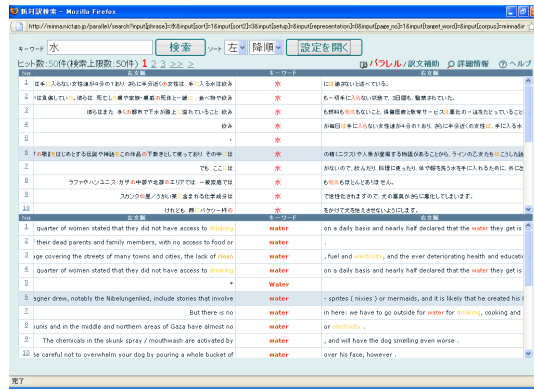
Figure 3: Screenshot of bilingual concordancer