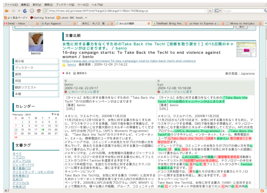
Figure 4: Comparative view of different translation versions

translators. Many NGOs face chronically the problem of a paucity of good volunteer translators. The retention rate of volunteer translators is low, which increase the burden of a small number of experienced translators, leaving them no time to give advice to inexperienced translators, which further reduce the retention rate of volunteers. To overcome this vicious cycle, mechanisms to enable inexperienced volunteer translators to train themselves in the cycle of actual translation activities is urgently needed and expected to be highly effective. MNH provides a comparative view function of any pairwise translation versions of the same document, as shown in Figure 4. Translators can check which parts are modified very easily through the comparative view screen, which can effectively works as a transfer of translation knowledge from experienced translators to inexperienced translators.