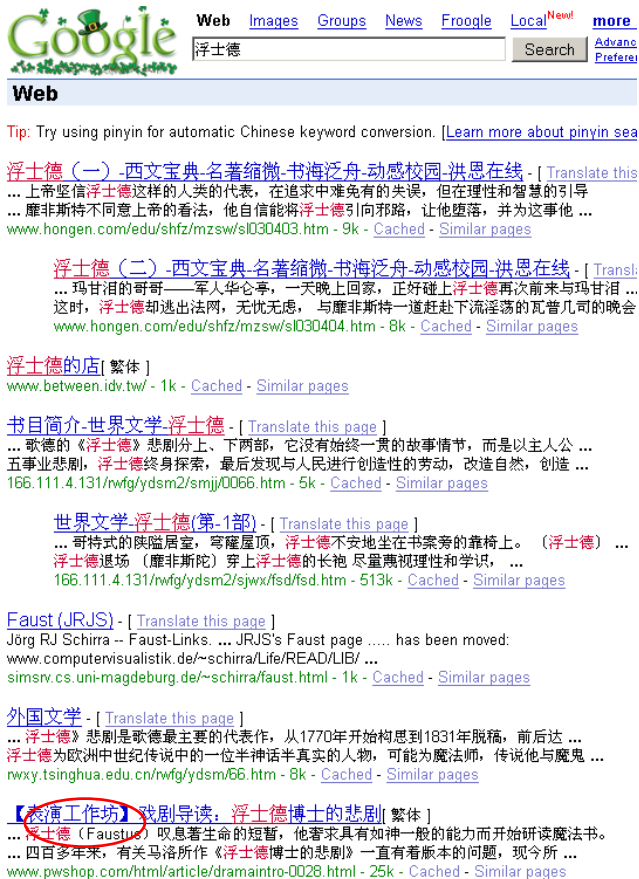
Figure 1. Returned mixed-language web page snippets using source query

We achieve 46% phrase translation accuracy when using 10 returned snippets, and 80% accuracy with 165 snippets. Both results are significantly better than several existing methods.