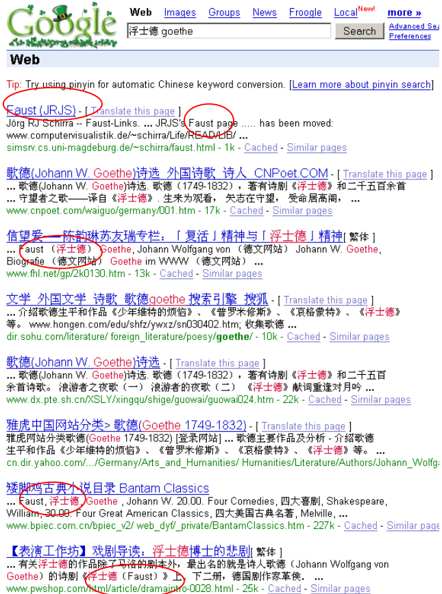
Figure 2. Returned mixed-language web page snippets using cross-lingual query expansion

For a Chinese key phrase f , we want to find its translation e from the web, more specifically, from the mixed-language web pages or web page snippets containing both f and e . As we do not know e , we are unable to directly retrieve such mixed-language web page using (f, e) as the query.