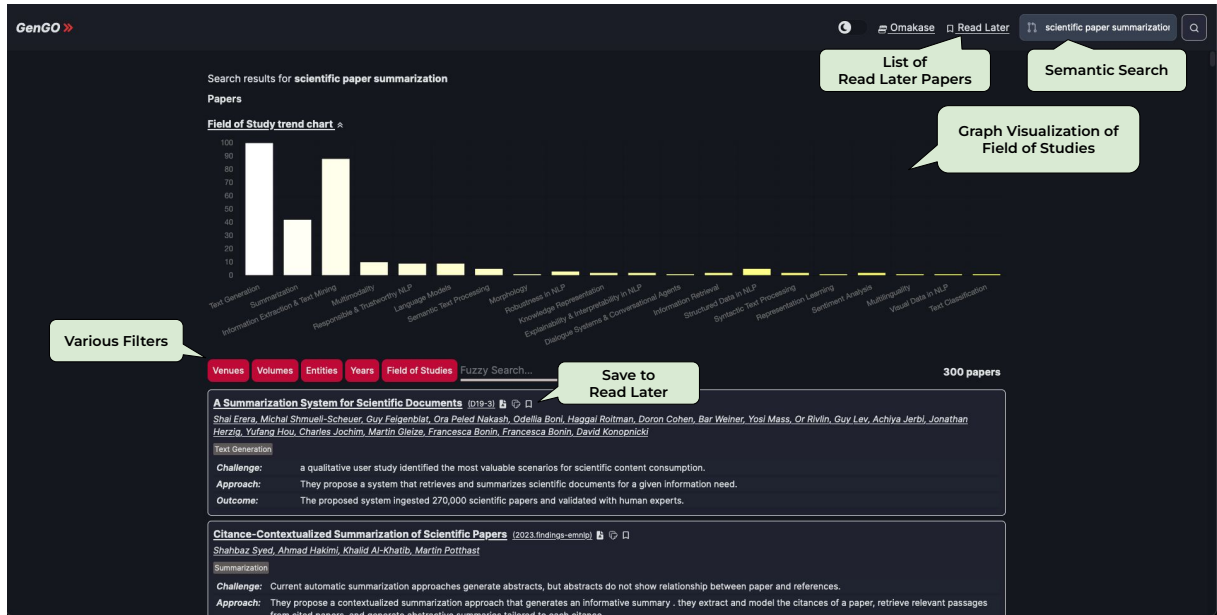
Figure 2: A screenshot showing how GenGO presents a list of papers retrieved by its semantic search functionality. Users can apply various filters to the list (e.g., venue, named entities, field of studies, etc...) to efficiently find relevant papers.

our disposal while indexing more than 30k papers. By using the cost estimator provided by Qdrant 4 , we estimate that when the number of indexed papers increases by ten times, it would require around 10 Euro per month.