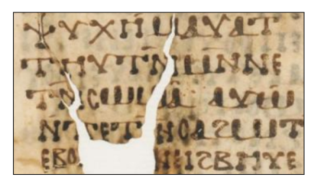
Figure 1: Excerpt from a papyrus letter by Besa, Abbot of the White Monastery in the 5th century, showing text without spaces and a lacuna.

loan word \Psi \tau \chi \mu 'psyche' is visible at the top left). Manuscript damage, also shown in the figure, represents a frequent challenge to annotation efforts (see Section 7).