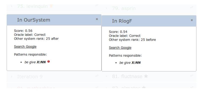
Figure 3: When the user click on the compare icon for an entity, the explanations of the entity extraction for both systems (if available) are displayed. This allows direct comparison of why the two systems learned the entity.

to two systems, and 2. an entity centric view that mainly focuses on the entities learned. Figure 1 shows a screenshot of the entity-centric view of SPIED-Viz. It displays following information: