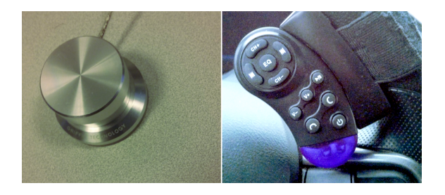
Figure 3: Alternative user interface controls

In contrast to our earlier WOZ study, the current version of the prototype does not present any visual information as we focus on the driving scenario. The previous WOZ study indicated that this information was distracting to the driver and not much valued by the participants.