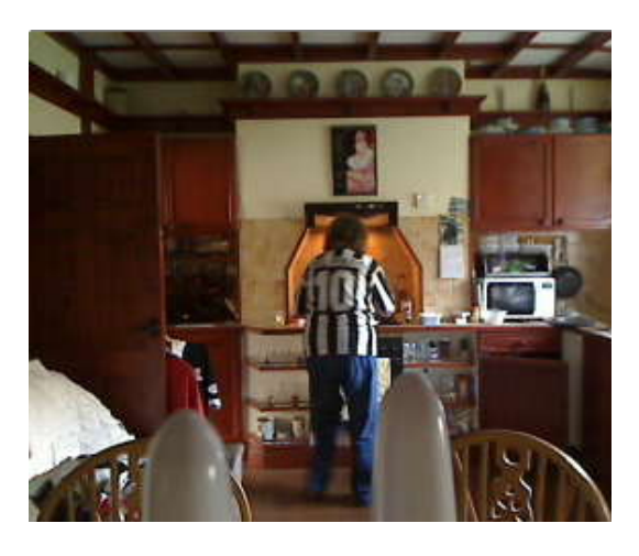
Figure 1: Making an omelette. In the real world, people ignore our handiwork! (note Nabaztag ears in the foreground)

The focus has turned out to be on robots rather than embodied conversational agents and the robot of choice was a Nabaztag. The Nabaztag is a commercially produced talking head from Violet in the