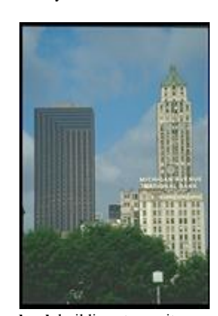
bank buildings trees city