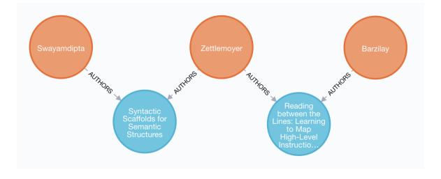
Figure 2: Shortest path between Swabha Swayamdipta and Regina Barzilay.

In the future, we plan to add DOI properties and ArXivId properties to the knowledge base.