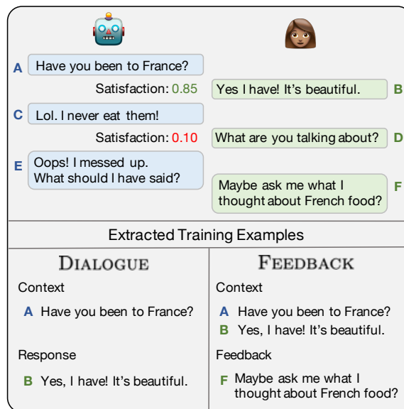
Figure 1: As the self-feeding chatbot engages in dialogue, it estimates user satisfaction to know when to ask for feedback. From the satisfied responses and feedback responses, new training examples are extracted for the DIALOGUE and FEEDBACK tasks, respectively, both of which improve the model’s dialogue abilities further.

Training a dialogue agent to converse like a human requires extensive supervision. The most common approach is to train models to imitate humans in large corpora of crowdsourced or scraped conversations (Serban et al., 2015). These fully-supervised conversations tend to be expensive to collect in sufficient quantity and/or occur in settings with significant differences from the deployment environment (Ross et al., 2009). Instead, dialogue agents would ideally learn directly from dialogue, the conversations they participate in after deployment, which are usually abundant, task-specific, dynamic, and cheap. This corresponds to the way humans learn to converse—not merely observing others engaging in “expert-level” conver-