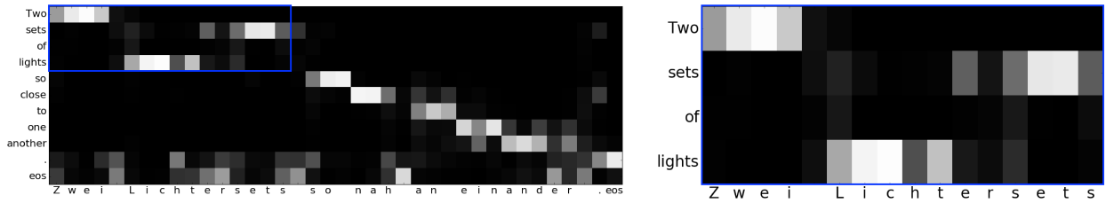
Figure 3: Alignment matrix of a test example from En-De using the BPE→Char (bi-scale) model.

for computing soft-alignments. In the case of subword-level decoder, we observed no difference between choosing any of the two layers of the decoder against using the concatenation of all the layers (Table 1 (a–b)). On the other hand, with the character-level decoder, we noticed an improvement when only the slower layer ( h^2 ) was used for the soft-alignment mechanism (Table 1 (c–g)). This suggests that the soft-alignment mechanism benefits by aligning a larger chunk in the target with a subword unit in the source, and we use only the slower layer for all the other language pairs.