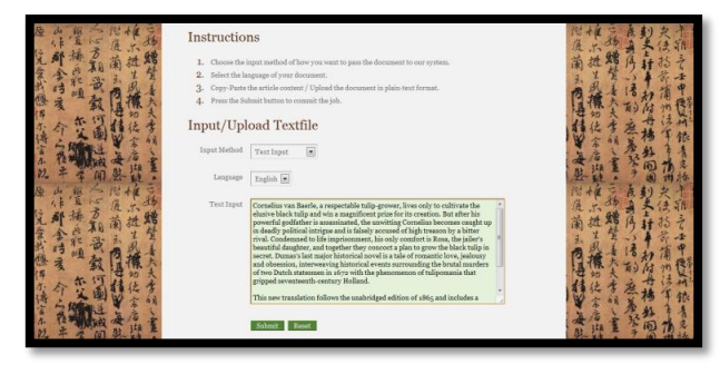
Figure 2. Input Screen-Shot

We developed an online demos system using JAVA (JDK 1.7). The system currently supports the detection of documents in both English and Chinese. Users can either upload the plain text file of a suspicious document, or copy/paste the content onto the text area, as shown below in Figure 2.