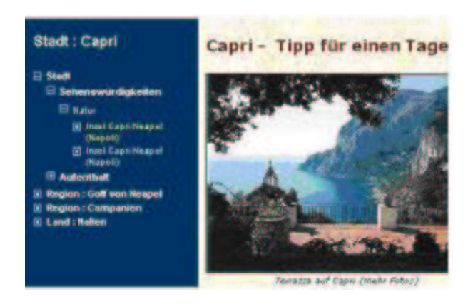
Figure 1: Link Target Page (excerpt). The instance the web document is associated to (Isle of Capri) is shown on the left, together with neighboring concepts in the ontology, which the user can navigate through.

A methodology for automatically enriching web documents with typed hyperlinks has been developed and applied to several domains, among them the domain of tourism information. A core component is a domain ontology describing tourist sites in terms of sights, accommodations, restaurants, cultural events, etc. The ontology was specialized for major European tourism sites and regions (see Figure 1). It is associated with a large selection of