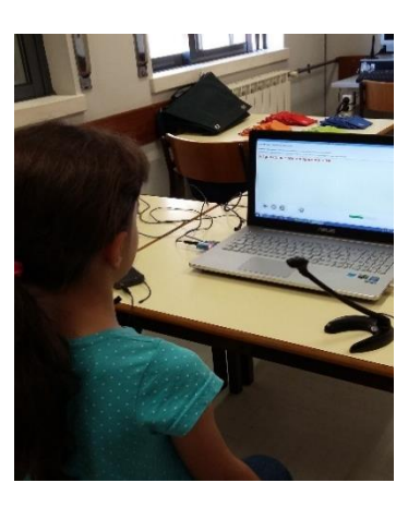
Figure 1: Example of the recording environment.

The corpus of children reading aloud was collected at 2 private and 9 public schools in urban centres and periphery areas of the central Portugal region, with children that attend primary school, aged 6 to 10 years old. A specific application was developed in which the sentences are displayed in a large font size on a computer screen simultaneously with the start of recording. The recording environment and a screenshot of the application can be seen in Figure 1 and Figure 2. Children are asked to read aloud a set of 20 sentences and 10 individual pseudowords. A lapel Lavalier microphone (Shure WL93) was used as the main recording device, accompanied by a standard table top PC microphone as backup (Plantronics Audio 10). The recordings were performed in chosen school classrooms that exhibited low reverberation and noise.