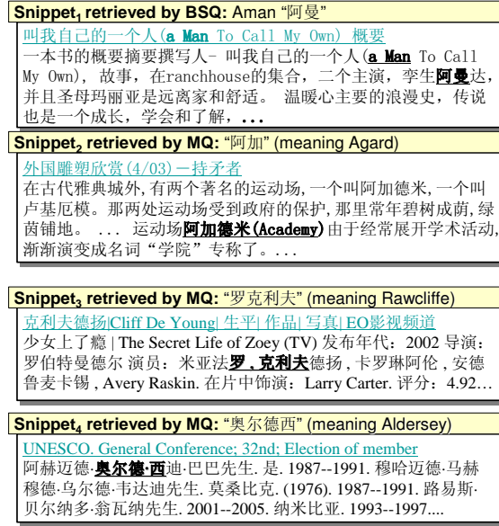
Figure 3: Snippets causing errors in Web counts

alone. Table 5 compares Web counts with features mined from the Web when they are used as features in g(h_i) = \{Pr(h_i|S), Web(W_l)\} in MEM_{WM} and SVM_{WM} (our proposed method), while \{Pr(h_i|S), WebCounts_x(h_i)\} in MEM_{WC} and SVM_{WC} . Here, Web(W_l) is a set of mined features from W_l as described in Fig .2.