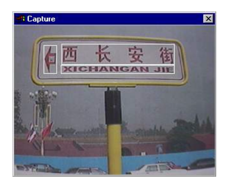
Figure 5 An example of automatic sign detection