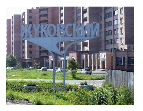
Figure 1 A sign embedded in the background

recognition of text in video imagery is challenging due to low resolution of characters and complexity of background. Research in video OCR has mainly focused on locating the text in the image and preprocessing the text area for OCR [4][6][7][9][10]. Applications of the research include automatically identifying the contents of video imagery for video index [7][9], and capturing documents from paper source during reading and writing [10]. Compared to other video OCR tasks, sign extraction takes place in a more dynamic environment. The user's movement can cause unstable input images. Non-professional equipment can make the video input poorer than that of other video OCR tasks, such as detecting captions in broadcast news programs. In addition, sign extraction has to be implemented in real time using limited resources.