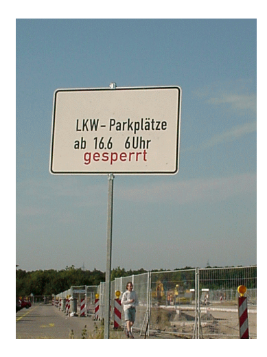
Figure 2 A German sign

Sign translation requires sign recognition. A straightforward idea is to use advanced OCR technology. Although OCR technology works well in many applications, it requires some improvements before it can be applied to sign recognition. At current stage of the research, we will focus our research on sign detection and translation while taking advantage of state-of-the-art OCR technologies.