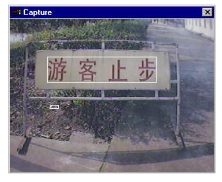
Figure 6 An example of false detection

Figure 7 illustrates two difficult examples of sign detection. The text in Figure 7(a) is easily confused with the reflective