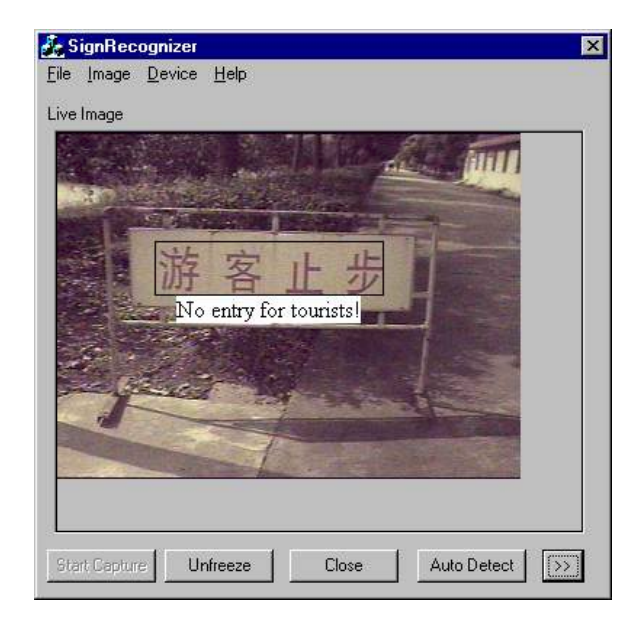
Figure 4 The interface of the prototype system

An efficient user interface is important to a user-centered system. Use of interaction is not only necessary for an interactive system, but also useful for an automatic system. A user can select a sign from multiple detected signs for translation, and get involved when automatic sign detection is wrong. Figure 4 is the interface of the system. The window of the interface displays the image from a video camera. The translation result is overlaid on the location of