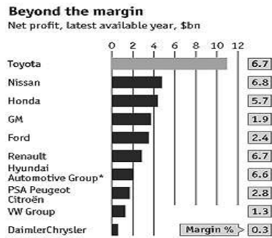
Figure 1: An Example Infographic