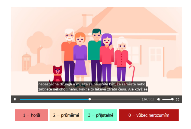
Figure 1: A detail of the default layout with the video document "Dinge Erklärt: Impfen...". The video is at the top, overlaid by two lines of subtitles in Czech, followed by buttons for Continuous Rating. The button labels are: 1: Worse; 2: Average; 3: Good; 0: I do not understand at all.

Candidate systems for simultaneous speech translation differ in quality of translation, latency and the approach to stability. Some are streaming, only adding more words (Grissom II et al., 2014; Gu et al., 2017; Arivazhagan et al., 2019; Press and Smith, 2018; Xiong et al., 2019; Ma et al., 2019; Zheng et al., 2019; Iranzo Sanchez et al., 2022), some allow re-translation as more input arrives (Müller et al., 2016b; Niehues et al., 2016; Dessloch et al., 2018; Niehues et al., 2018; Arivazhagan et al., 2020). Finally, subtitle presentation options