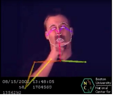
Figure 3: OpenPose keypoints on Video Dataset

When we run the dataset through OpenPose the output visually shows the facial keypoints being mapped to the video.